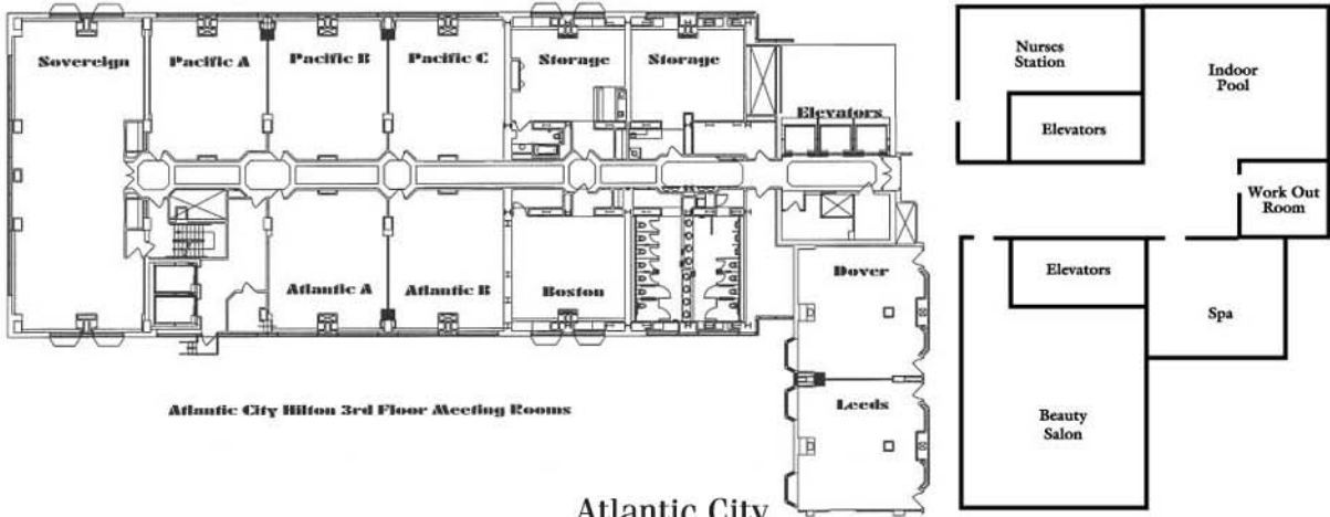
Atlantic City Hilton 3rd Floor Meeting Rooms